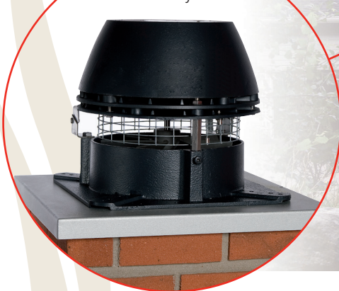
RS Chimney Fan

The perfect fire features a flame that's just the right size – not too high or too low and that doesn't allow smoke to escape from the fireplace.